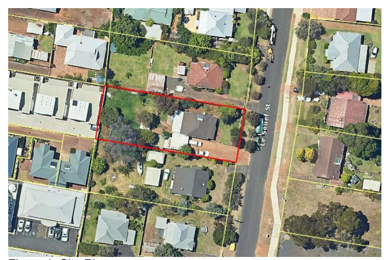
Figure 1: Site Plan