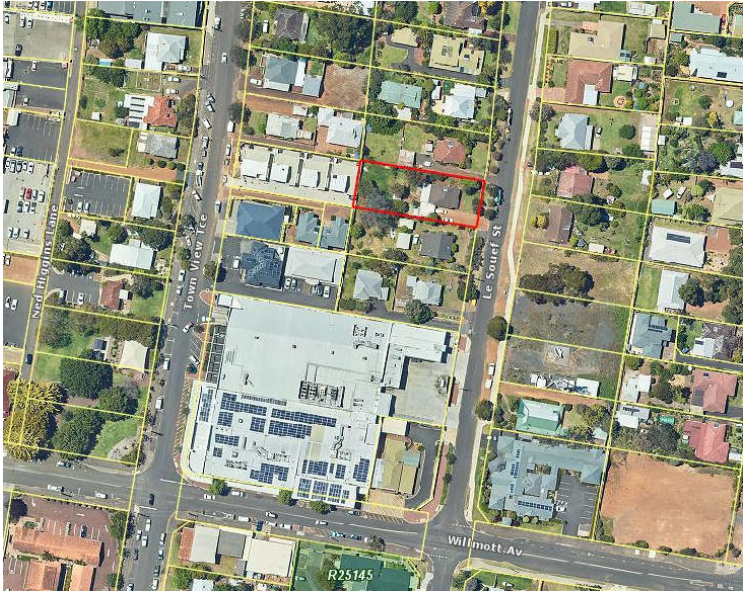
Figure 2: Locality Plan