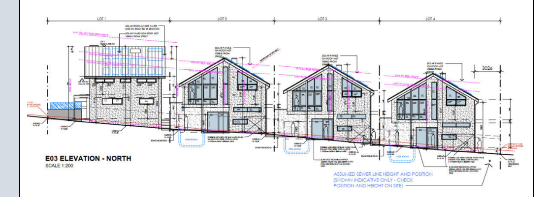
Figure 1: Ridge height variations