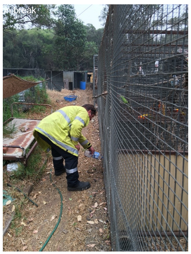
Fire fighters providing welfare during a bushfire