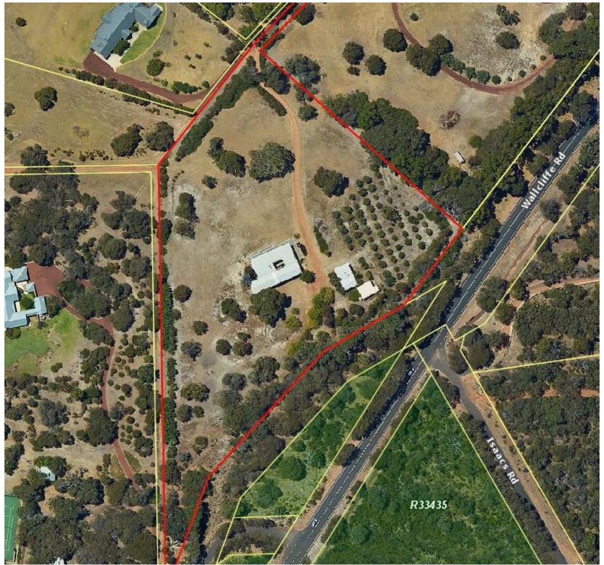
Figure 1: Aerial extract